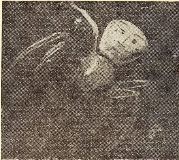
Spider with ' Human Face '

Acherontia styx Westwood, though it is difficult to imagine how these markings benefit these animals.